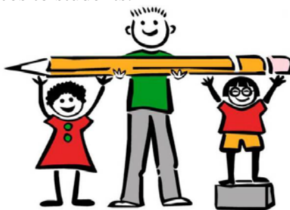
Figure 2 Avoid teaching students according to their aptitude to promote their overall development

Compared with the teachers of basic education, the teaching task of college teachers is more extensive, simply speaking, it is the teaching emphasis of basic education teachers to provide help to the students' English language and culture foundation, and teaching students to learn high quality and high difficulty knowledge points and broaden students' horizons are the teaching emphases of college teachers. However, from the point of view of the actual English teaching situation of most college teachers at present, the teaching plan and teaching rhythm in the teaching process are often based on the text content as reference, too standardized and formalized to carry out classroom teaching. In this context, even if teachers provide more professional teaching programs to students, it will also make the students' learning perspective limited in the textbook environment, can not ensure that students are familiar with and understand the current multi-cultural environment, but also should be difficult to give full play to their own English through a broad perspective. Therefore, in order to ensure the comprehensive improvement of students' comprehensive ability of English application, teachers should actively improve their teaching methods and provide multiple and more flexible teaching services to students.