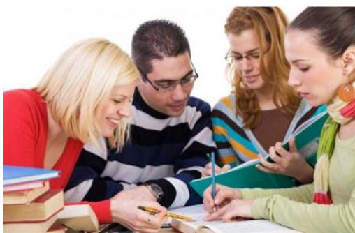
Figure 1 Multicultural infiltration to enrich classroom teaching